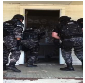
(MEMBERS OF THE SOUTHWEST ENFORCEMENT BUREAU)